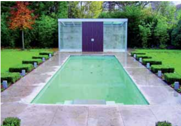
Biotop Pool Daldrup