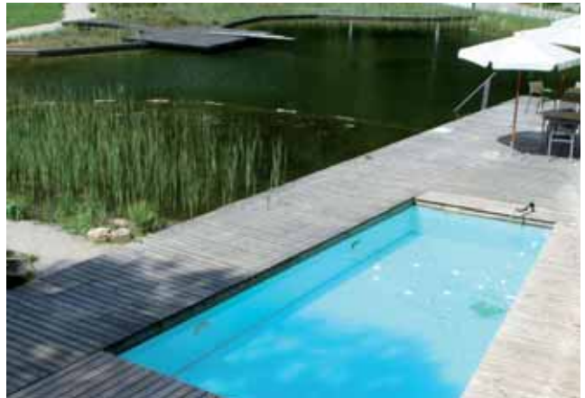
Biotop Pool Weidling