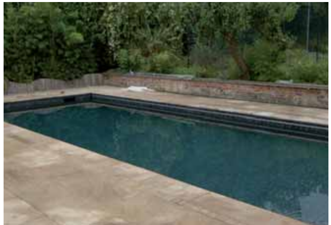
Biotop Pool Woodhouse