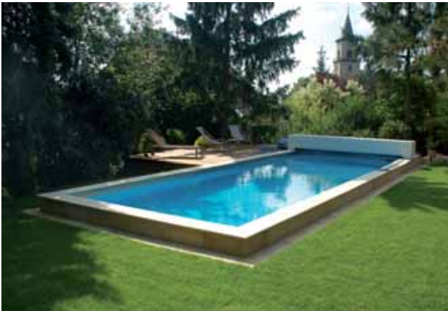
Biotop Pool Schuler