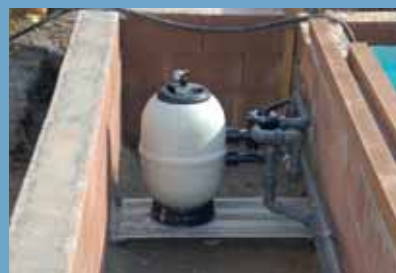
PhosTec – Circulation Filter1